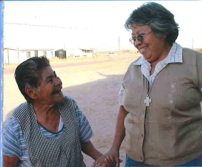
partners in our Franciscan mission